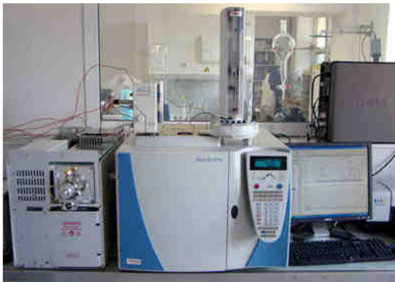
Photo 3 : GC/MS device of the laboratory – photography: N. Bouillon, CICRP.