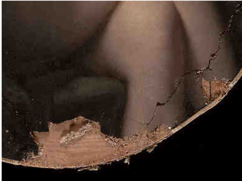
Photo 1 : Damages caused by the Stegobium paniceum on "Sainte Geneviève de Brabant" from Jean-Baptiste Greuze, Musée des Beaux Arts de Marseille

This scientific survey takes place in a broad interdisciplinary project about Stegobium paniceum infestation and reinfestation of glue paste lined easel paintings. This coleopteran of the Anobiidae specy has a strong attraction for the glue paste, in particular some kinds of recipes which contain a large proportion of flour (see the program infestation and reinfestation - this program is available in french, but will be soon available in english).